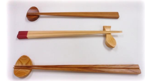
My chopsticks&chopstick rest(DAEN[oval]/Fish-shaped) set

A set comprises a pair of chopsticks and a chopstick rest, with both maximizing the high quality of the materials.