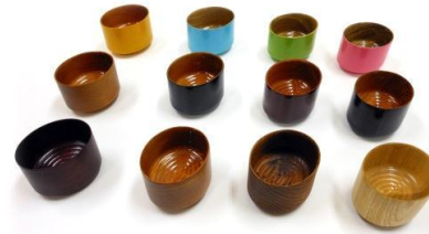
Small sake cup